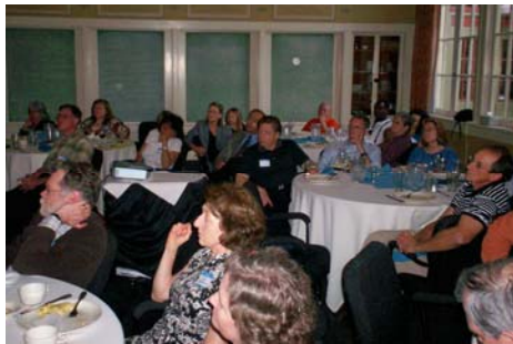
Attendees to the Spring Fling held at the Kennedy School in Portland in June.

OMA's Board of Directors and the Member Services Committee will hold the second OMA Listening Session on October 5, 2009 from noon-1:00pm . We will send an announcement via OMA Flash soon. We hope you will join us for a chance to speak directly to OMA board members about issues that are important to you!